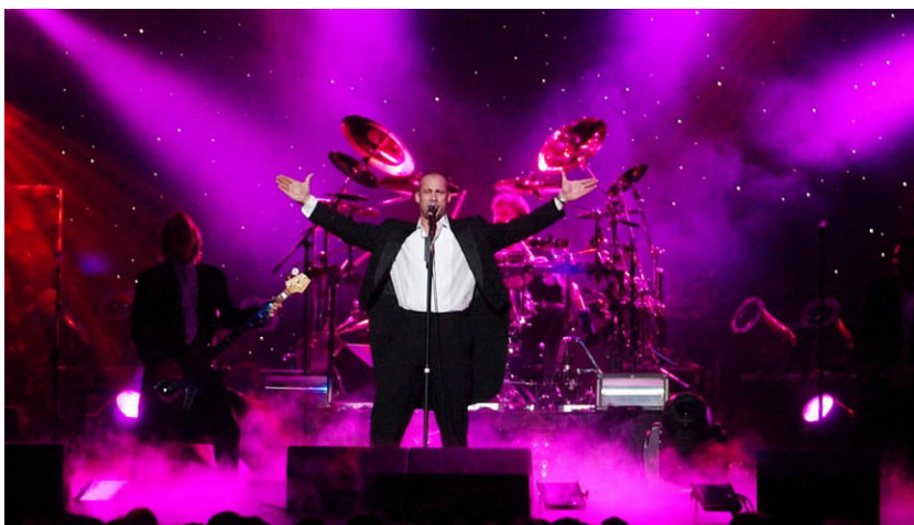
Trans-Siberian Orchestra brings its music and light show to the Bradley Center on Dec. 16.

Art & Soul Gallery: 5708 W. Vliet St. (414) 774-4185.